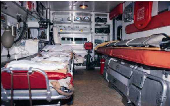
A.J. Heightman was involved in the design of the initial "MODULANCE" Type III Ambulances